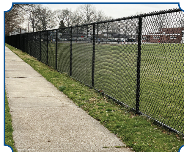
New perimeter fencing has been installed in several locations throughout the district to provide a more secure environment.