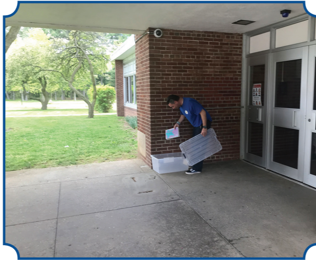
To limit indoor visitors, each school has a "drop box" outside the main entrance, where parents can drop off items for their children.