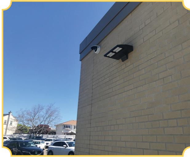
The district has installed exterior security cameras on all buildings. The district currently has 201 external cameras.

A full copy of the districtwide School Safety Plan is available upon request at central administration in the Office of the Superintendent of Schools or can be viewed online under the district tab at www.hicksvilleschools.org .