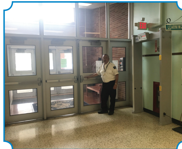
The district has increased the number of security guards stationed at each building.