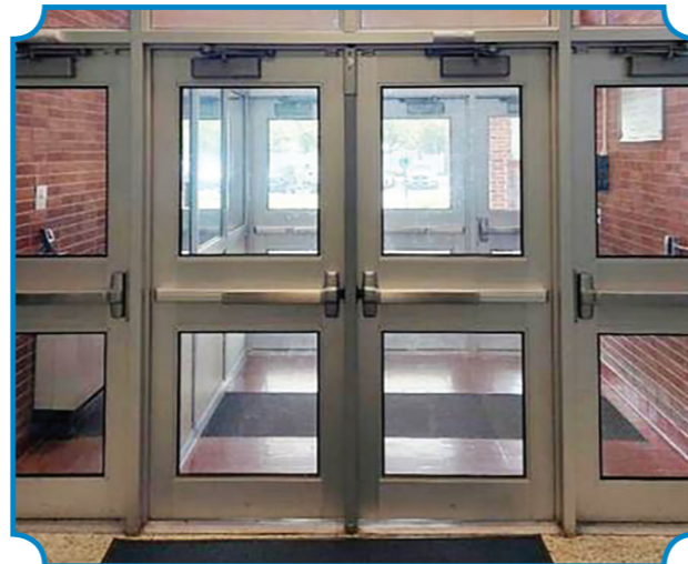
Each school has a double-door, single-person access control security space, also known as a mantrap, at the main entrance.

Please scan this code to view the district's safety plan. Scroll to the bottom of the homepage and click "Districtwide Safety Plan" under Important Links.