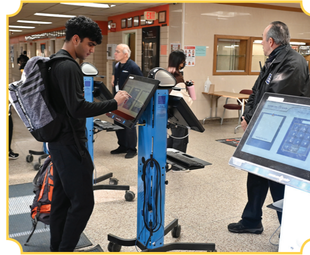
A Hicksville High School student scans his identification card upon entering the building using the ScholarChip program.